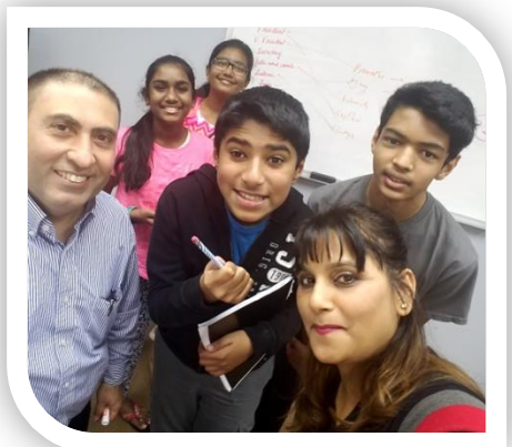
After class fun with our leaders at Irving Center